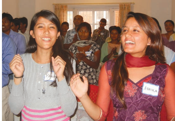
Left: Trained CBSI C&Y leaders, once mistreated in a distant city, find healing and blessed friendships in CBSI's partnership with a human rights ministry in Kathmandu, Nepal.