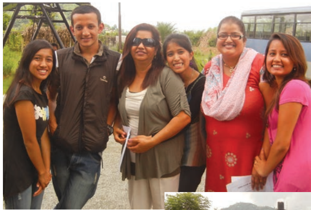
Left: Participants in a CBSI C&Y training session hang out at Asha Nepal in Kathmandu.

"We had hard roads to travel for many years. I lost many important things of this world, but I experienced God! I saw Him at work, always keeping His promises. I want to go on doing this, helping people know Him deeply, and CBSI will be an invaluable help."