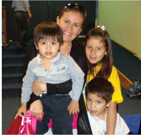
Below: A Sunday school teacher at a church in Madrid, who received CBSI training in May, poses with three immigrant children in her care.

love for and dedication to the next generation of young people in Spain.