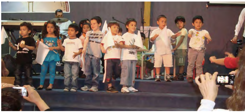
Left: These children, singing during worship at the Madrid church that hosted CBSI training in May, will be in a Children & Youth Ministry class beginning in September.