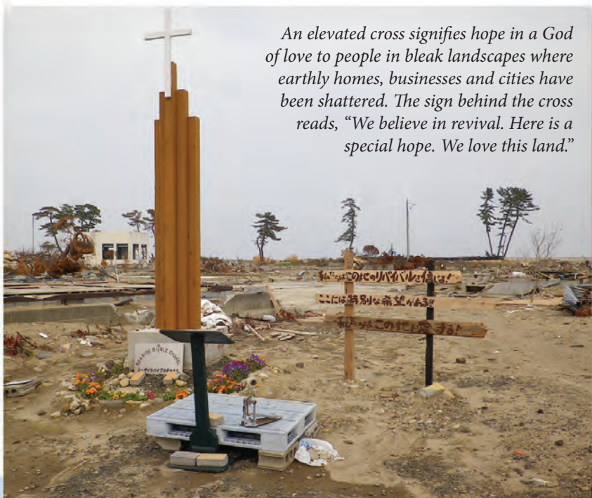
An elevated cross signifies hope in a God of love to people in bleak landscapes where earthly homes, businesses and cities have been shattered. The sign behind the cross reads, "We believe in revival. Here is a special hope. We love this land."