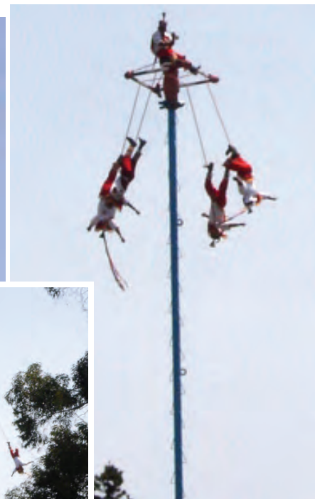
Right: Voladores de Papantla, or the Papantla Flyers, perform a ritual dance that the Totonac people in Mexico have been doing for perhaps 1,500 years — climbing a 150-foot pole and then falling back and flying in a spiral to the ground.