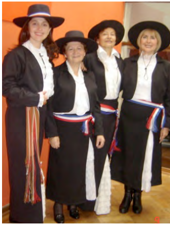
CBSI class members dress in a time-honored way for a Chilean Independence Day celebration.