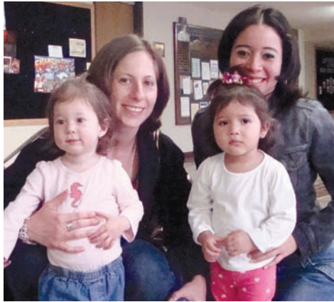
Coming generations will be blessed through this CBSI ministry within the United States.